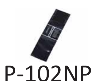
Nylon Pediatric Cuff 35cm x 11cm

Nylon Nurse / Adult Cuff with D-ring 52cm x 14.2cm