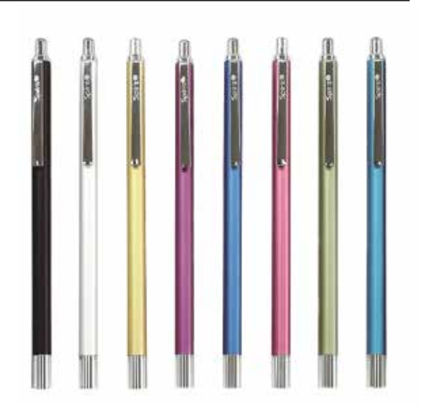
Nive / Red Cohor